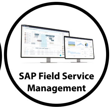
SAP Field Service Management

Time tracking made easy. Coresuite Time is an industry-independent time recording system that keeps your resources and projects under control.